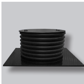
ND RS-30 Inspection Chamber

The ND RS-30 Inspection Chamber is made out of robust polyethylene that has a high density and secures the drainage of intensive green roofs. The ND RS-30 Inspection Chamber has a closed lid and a height of approx. 300 mm.